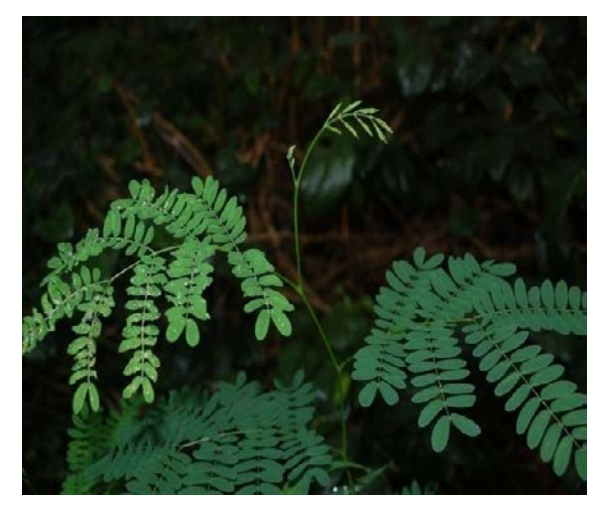
Figure 5: Acacia leucocephala

Leucaenaleucocephala is a medium sized fast growing tree belongs to the family Fabaceae.