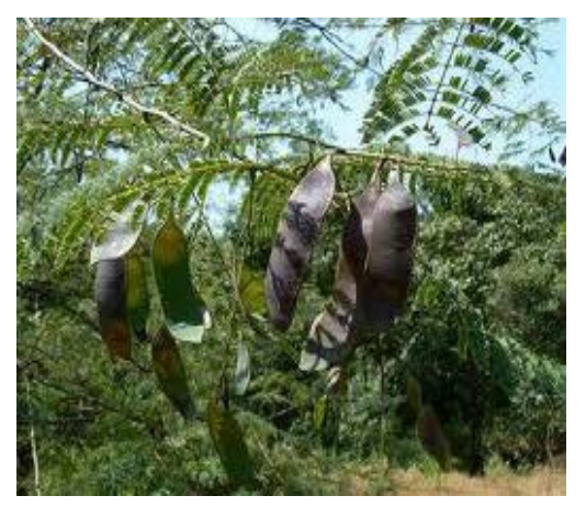
Figure 4: Acacia polyacanthais

Acacia polyacanthais of the fabaceae family a group of plants called campylacantha.[36]. It is commonly called "Karo" by the Hausa speaking communities in Northern N igeria. The tree often grows in the moist, subtropical bushveld of Africa, usually in alluvial soils near rivers. It is widespread in tropical Africa, occurring from Gambia to Ethiopia and southwards to Kenya and Zimbabwe [37]. The white-stem thorn is a large, erect tree that grows to an average height of 10-15 m, exceptionally large trees may reach a height of 25 m. The stem of younger trees appears yellowish with papery bark and persisting prickles. As it gets older, the bark gets smoother and whitish grey, with bark flakes sometimes present. Young branches are covered in silvery hairs and the whole tree is covered in dark brown to black hooked thorns in pairs. The leaves are twice compound with 14-35 pairs of pinnae and 20-60 leaflets per pinna. Leaves are fairly large and arranged singly along the shoots. The upper surface of the leaves is darker than the underside, and mostly with hairs on the margins and on the leaf stalk. The flowers that appear from September to December are light yellow to cream.[38]