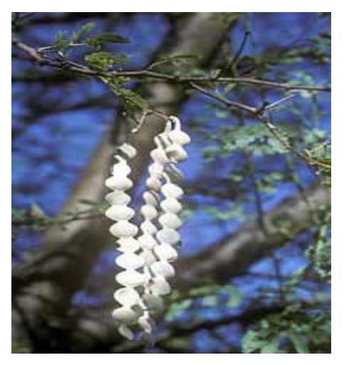
Fig. 2: Pods of A. nilotica.

Acacia nilotica is a medium-sized, thorny tree, evergreen tree with a short trunk and having round spreading crown with feathery foliage, found in the whole drier parts of India. Acacia nilotica is a single stemmed plant, grows to 15-18 m in height and 2-3 m in diameter. The leaves are fine and densely hairy with 3-6 pairs of pinnate consisting of 10-20 pairs of leaflets that are narrow with parallel margins and are