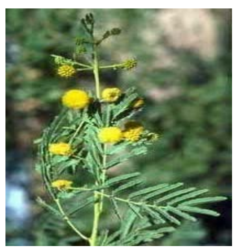
Fig. 1: A twig of A. nilotica showing flowers