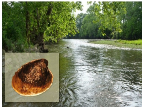
Figure 2: Conservation of Aquatic Biodiversity in Vietnam

Several initiatives concerning aquatic biodiversity are being carried out by the FAO Fisheries and Aquaculture Department. These initiatives are crucial to the future of fisheries and aquaculture. The framework for FAO's fisheries work is provided by the 1982 United Nations Convention on the Law of the Sea (UNCLOS 1982) and the FAO Code of Conduct for Responsible Fisheries (CCRF 1995).