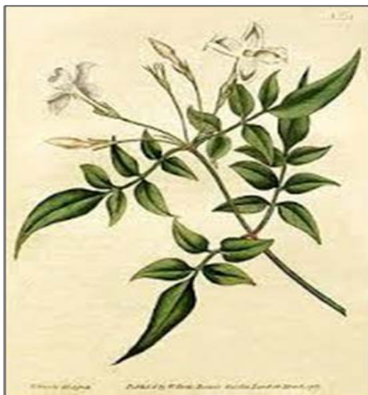
Fig. 11: Jasminum officinale plant