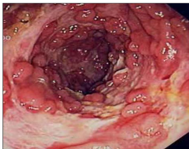
Fig. 1: Stomach acid secretion Fig. 2: Stomach ulcers