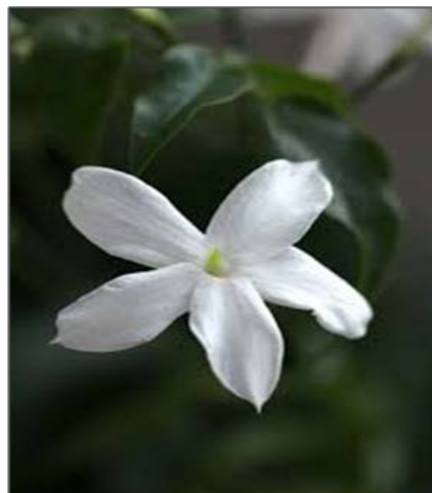
Fig. 12: Flower of Jasminum officinale plant

Jasmine (taxonomic name Jasminum ) is a genus of shrubs and vines in the olive family (Oleaceae). It contains around 200 species native to tropical and warm temperate regions of Eurasia, Australasia and Oceania. 11 Jasmines are widely cultivated for the characteristic fragrance of their flowers. Jasmine can be either deciduous (leaves falling in autumn) or evergreen (green all year round), and can be erect, spreading, or climbing shrubs and vines. Their leaves are borne, opposite or alternate. They can be simple, trifoliate, or pinnate. The flowers are typically around 2.5 cm (0.98 in) in diameter. They are white or yellow in color, although in rare instances they can be slightly reddish. The flowers are borne in cymose clusters with a minimum of three flowers, though they can also be solitary on the ends of branchlets. Each flower has about four to nine petals, two locules, and one to four ovules. They have two stamens with very short filaments. The bracts are linear or ovate. The calyx is bell-shaped. They are usually very fragrant. The fruits of jasmines are berries that turn black when ripe.